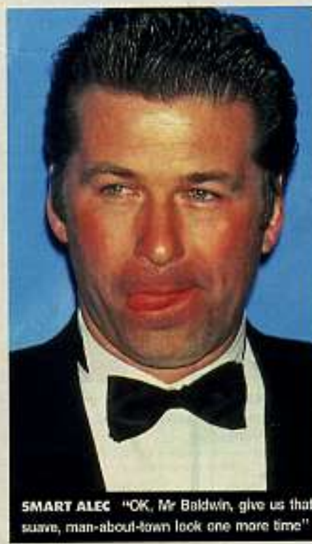
SMART ALEC "OK, Mr Baldwin, give us that suave, man-about-town look one more time!"