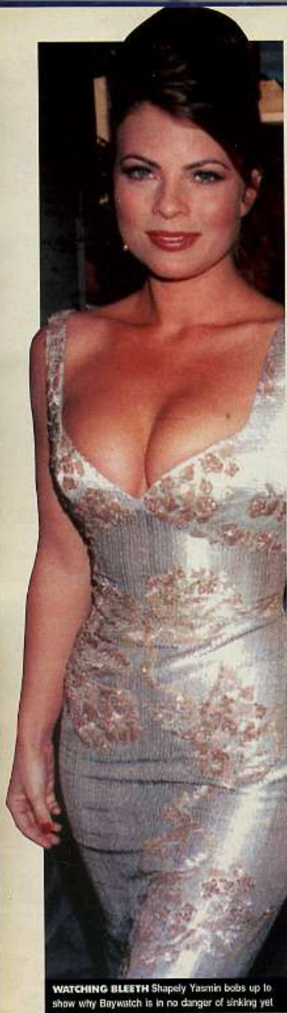
WATCHING BLEETH Shapely Yasmin bobs up to show why Baywatch is in no danger of sinking yet

MICK TAKES SOME STICK . . . BUT TRACY'S GOT IT LICKED