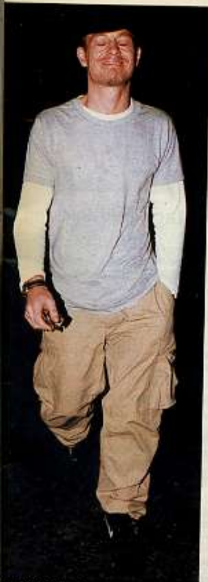
HAPPY DAZE Jason Donovan needs a Dreamcoat for his sleepwalk around town