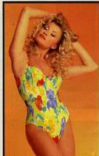
POOL WINNERS Join fashion's new wave in our bright floral swimsuits PAGES 32-33