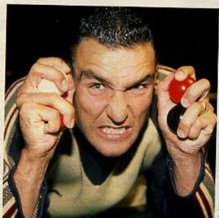
CENTRE POCKET Football hard man Vinnie Jones gets in some serious practice for a rematch of his famous clash with Gazza...