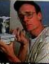
Matt Frewer is Pani