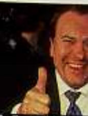
Rip Torn did the v