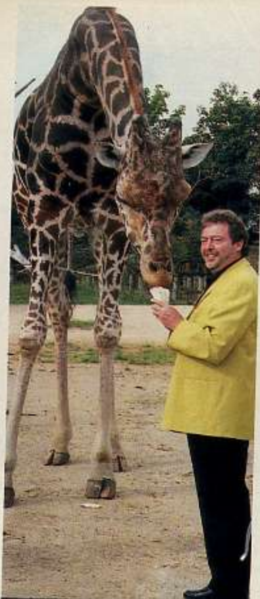
TALL ORDER Seems like no-one gave the giraffe the golden advice: 'Never work with kids or Jeremy Beadle'.

KYLIE'S DRESSED TO TRILL, WHILE CARMEN'S OUT TO THE