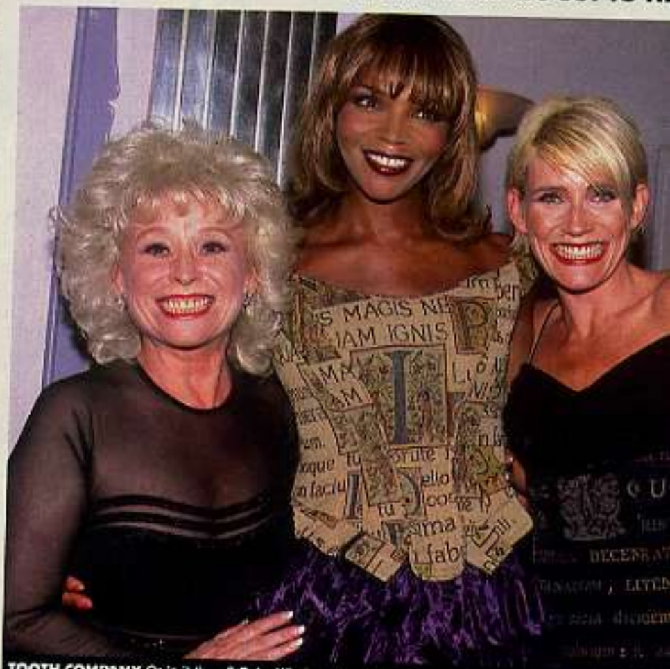
TOOTH COMPANY Or is it three? Babs Windsor, Valerie Campbell and Michelle Collins flash the pearly whites.