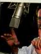
James Woods as

As everyone knows, does anything by he cast was essential became yet another Big names clamour Disney magic, includ