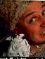
Bobcat Goldthwait is

4 You get to do great things as just a voice . . . you can fall off cliffs, spin in the