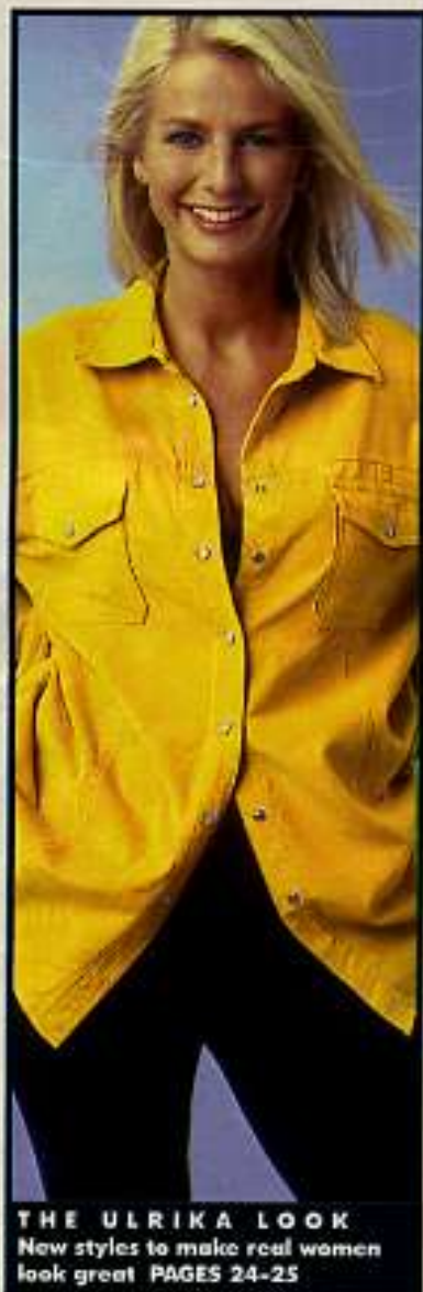
THE ULRICA LOOK New styles to make real women look great PAGES 24-25