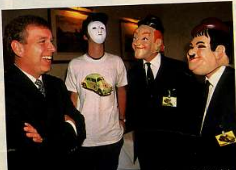
HARDY ANNUAL "Another fine mess? Ha, you don't know you're born. Let me tell you about another fine mess..." Prince Andrew becomes party bore.