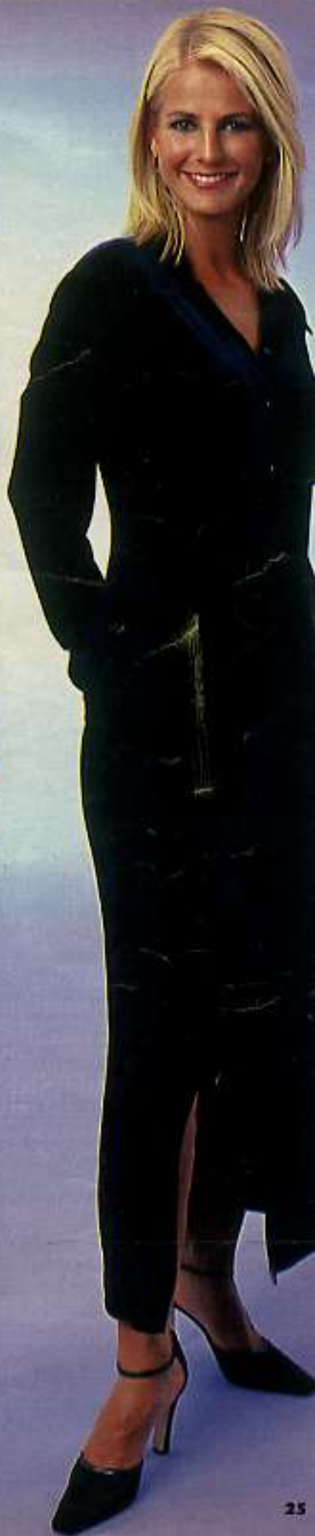
RIGHT: Long velvet shirt dress, £45.