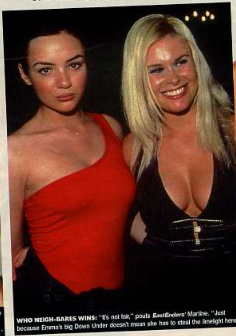
WHO NEIGH-BARES WINS: "It's not fair," pouts EastEnders ' Marlene. "Just because Emma's big Down Under doesn't mean she has to steal the limelight here."