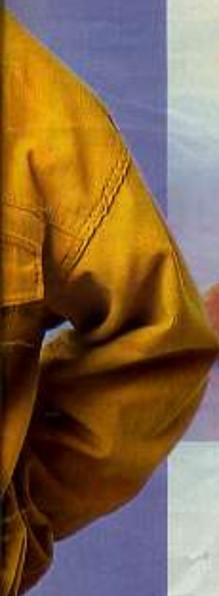
LEFT: Saffron cord shirt, £20; black slim leg jeans, £19.