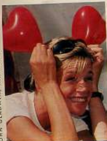
HEART TO HEART Is Zoe really so desperate for romance? No, it's all been blown up out of proportion...