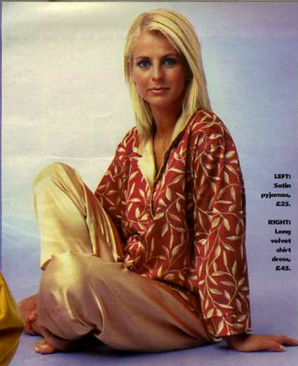
LEFT: Satin pyjamas, £25.