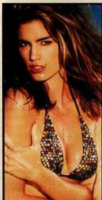
CINDY'S SECRETS Find out how you can look this good on Pages 18-19

Daring or demure... our choice of the most beautiful wedding gowns